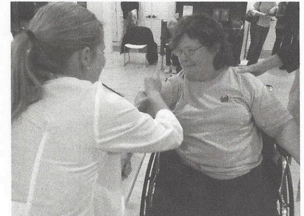
MVHI-sponsored flu clinic in Orford, October 2014

"Protecting and promoting the health of our communities since 2001."