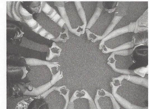
Y2Y participants celebrate Red Ribbon Week with a "For the Love of..." campaign designed to educate their peers.